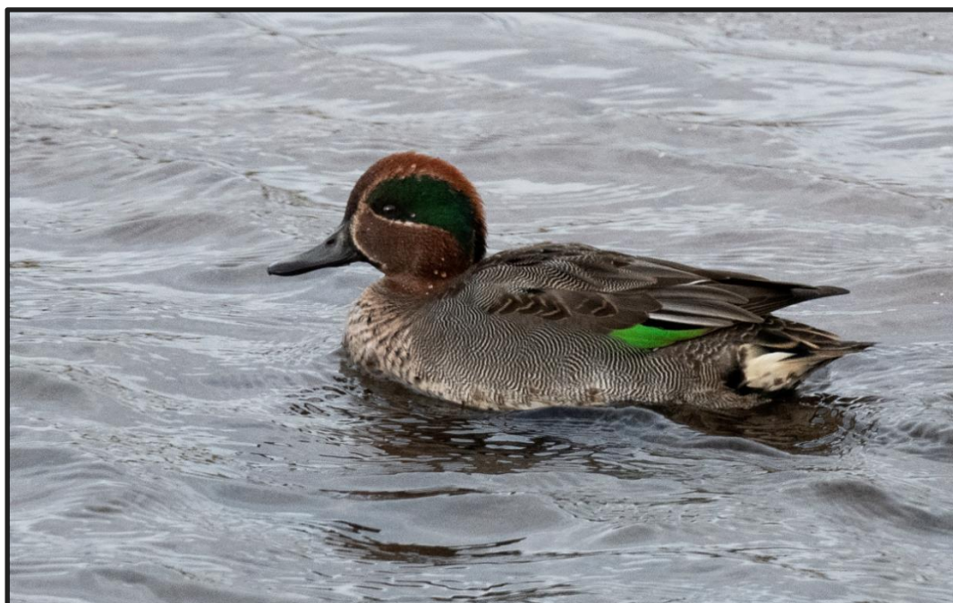
Eurasian Teal – Campbeltown Loch / 22 nd December