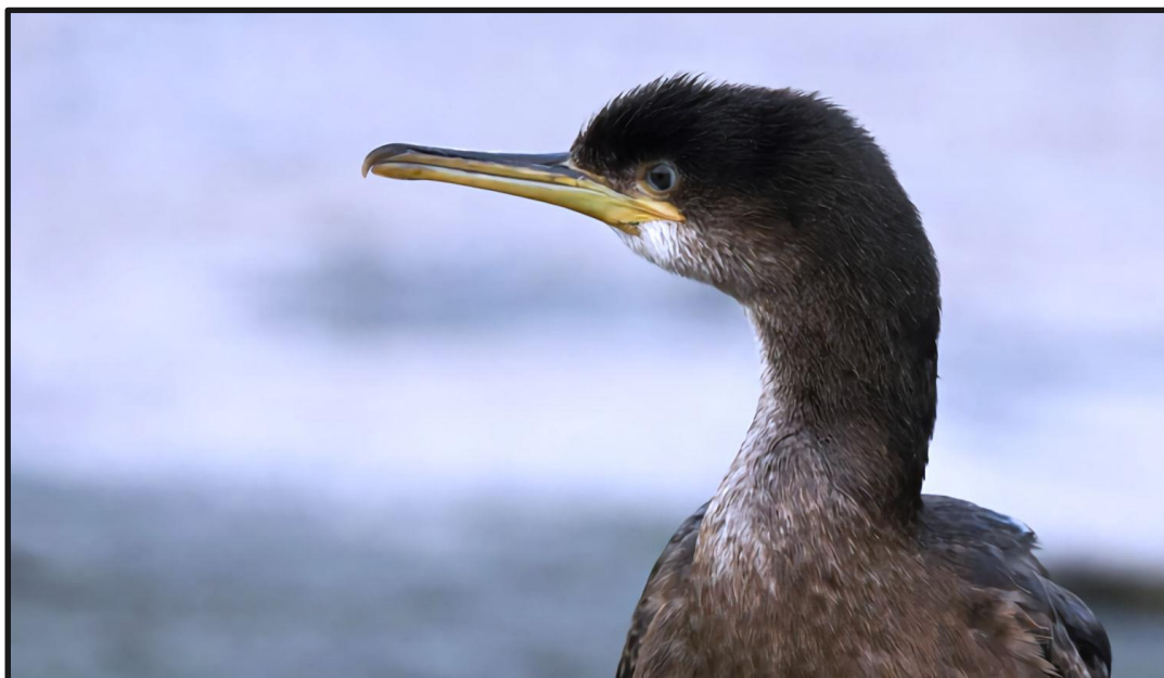
European Shag – 1cy Campbeltown Loch / loafing on harbour 14 th December