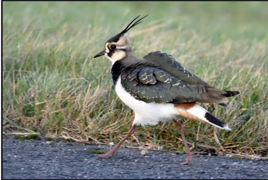
Lapwing – Airbase 30 th December