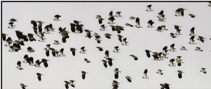
Lapwings – 12 th December

The Laggan: 500+ >W over Bleachfield on 12 th .