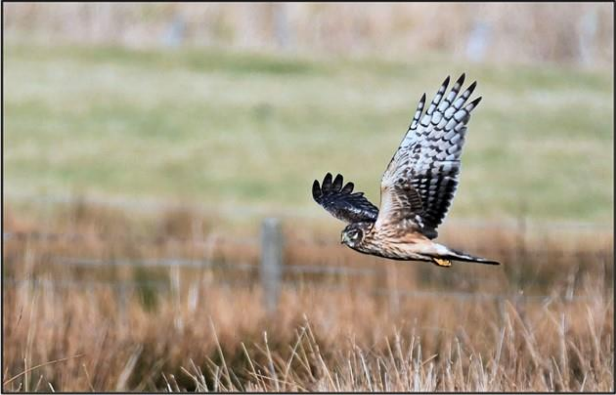
Hen Harrier – ringtail by Stewarton 15:25hrs / 7 th December