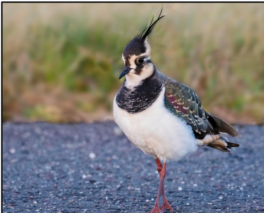
Lapwing – Airbase 30 th December