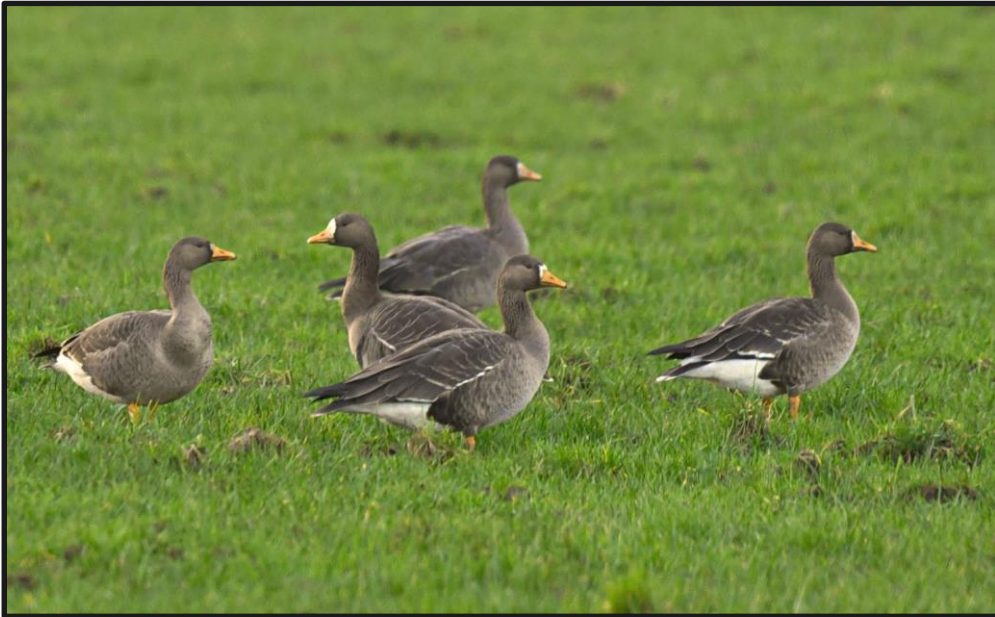
White-fronts – 3 rd December