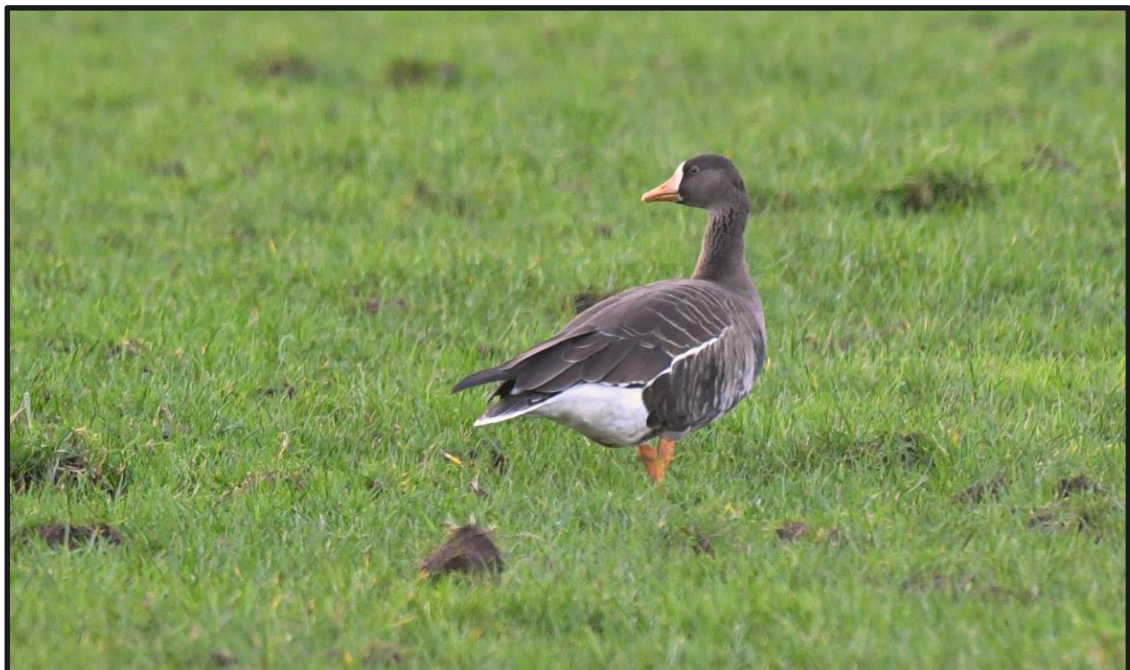
White-front – 3 rd December

The Laggan: one at Drumlemble on 20 th .