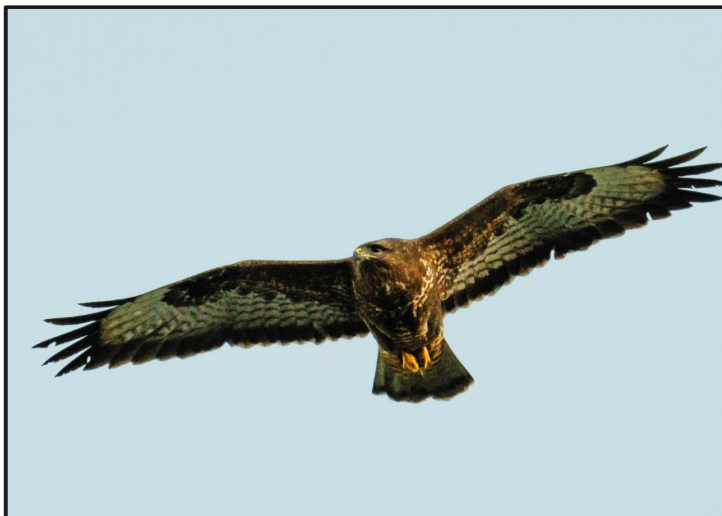
Common Buzzard – Airbase 30 th December