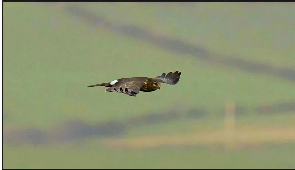
Hen Harrier - ringtail 15:18hrs / 20 th December

By Stewarton: 2 males regular at roost site all month. Single ringtail(s) there on 3 rd , 7 th , 12 th and 20 th .