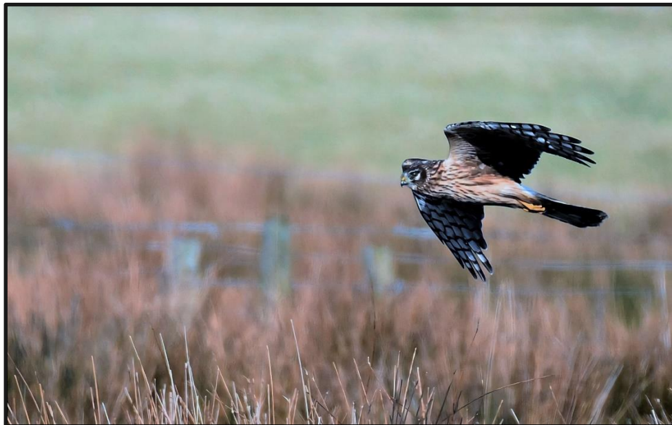
Hen Harrier - ringtail 15:25hrs / 7 th December

NW Kintyre: 2 males at Kennacraig on 11 th (David Jardine pers. comm. ). Very scarce in Kintyre / mainly an infrequent autumn passage visitor at MSBO.