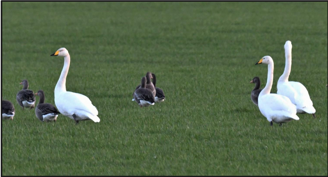
Whoopers – at the Laggan / 20 th December