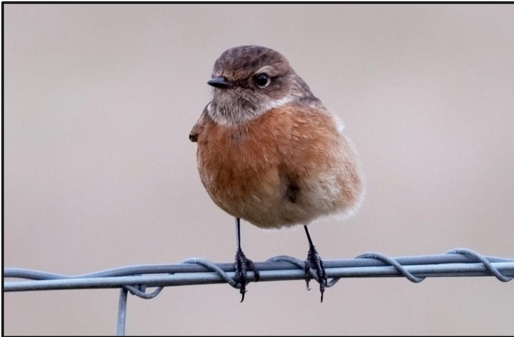
Stonechat – Airbase 25 th December / Warden