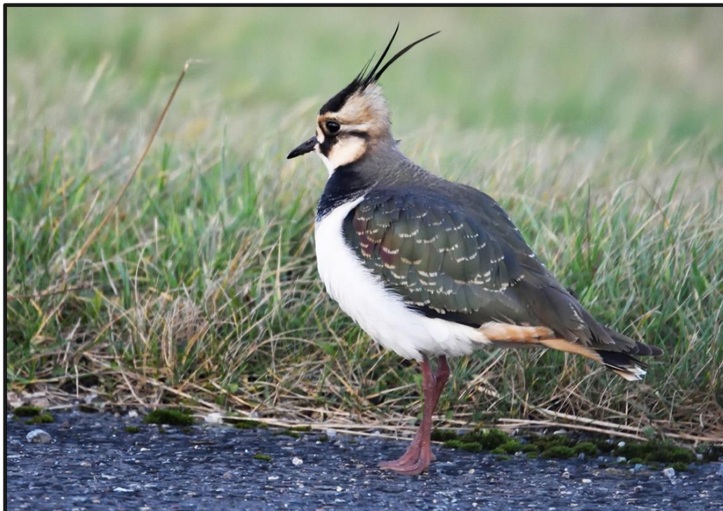
Lapwing – Airbase 30 th December / Jo Goudie