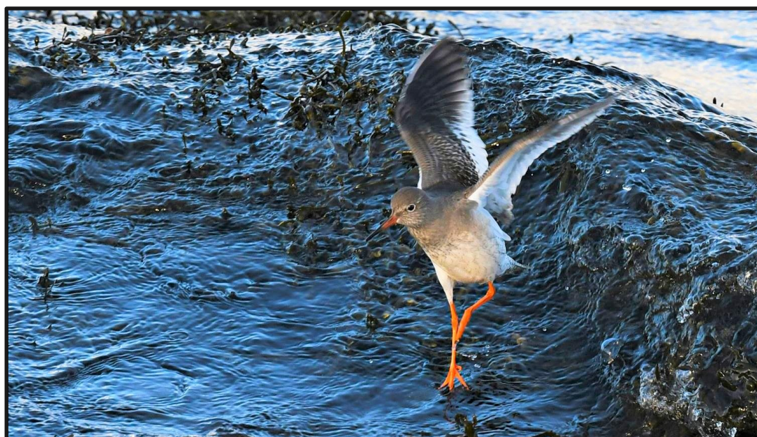
Common Redshank – MSBO 22 nd December