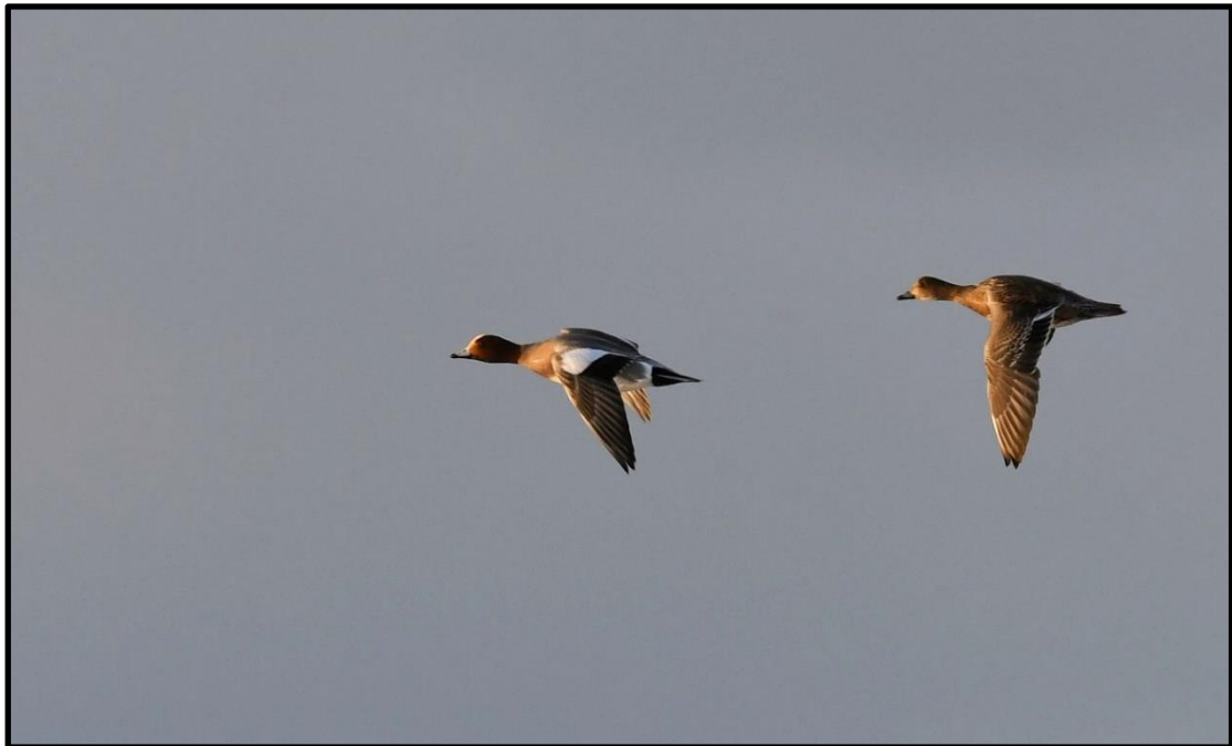
Wigeon – 6 th January

Campbeltown: 50 on floods at Kilmichael on 20 th (per Jim Dickson).