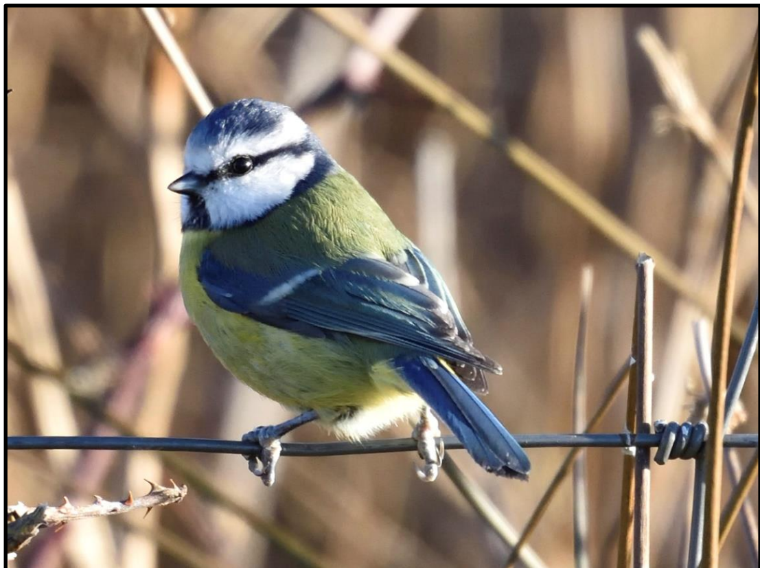
Blue Tit – 2 nd / JG