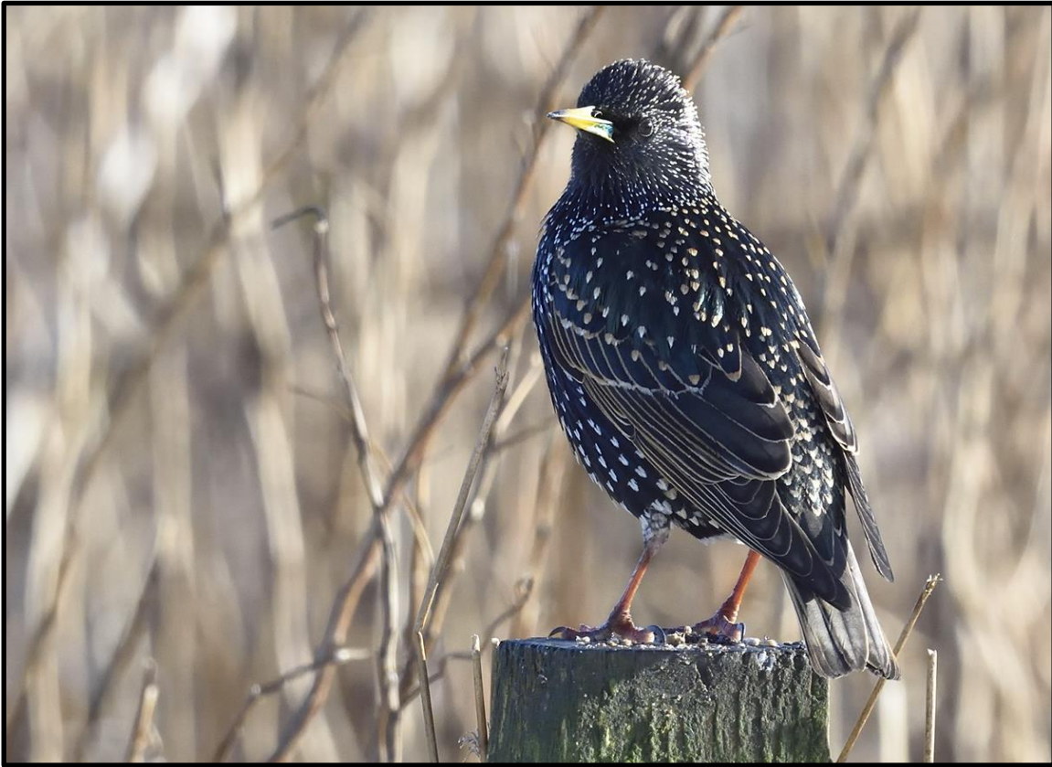
Starling – male 24 th / JG