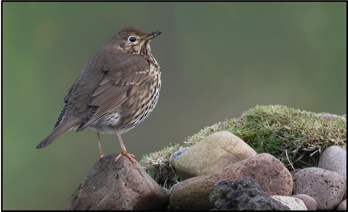
Song Thrush – 12 th / JG