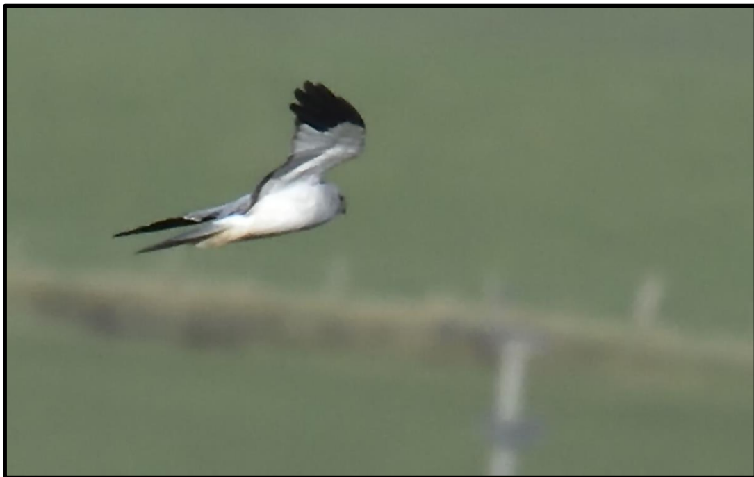
Hen Harrier – 30 th January