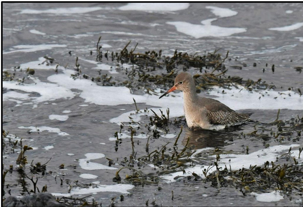
Redshank – 6 th January