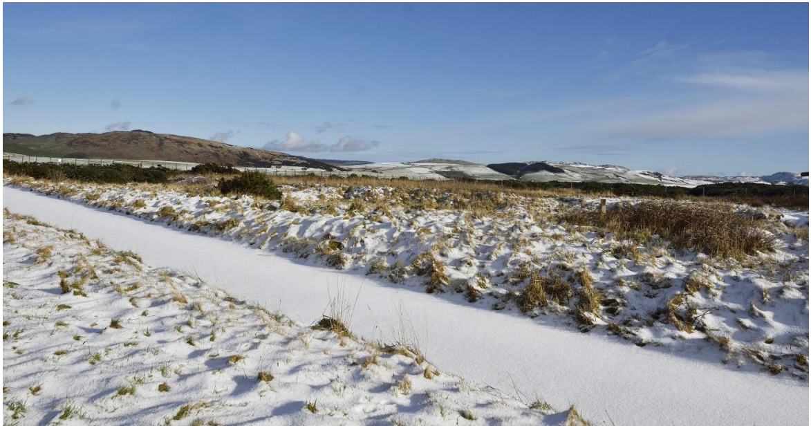
Machrihanish Airbase – 24 th / JG