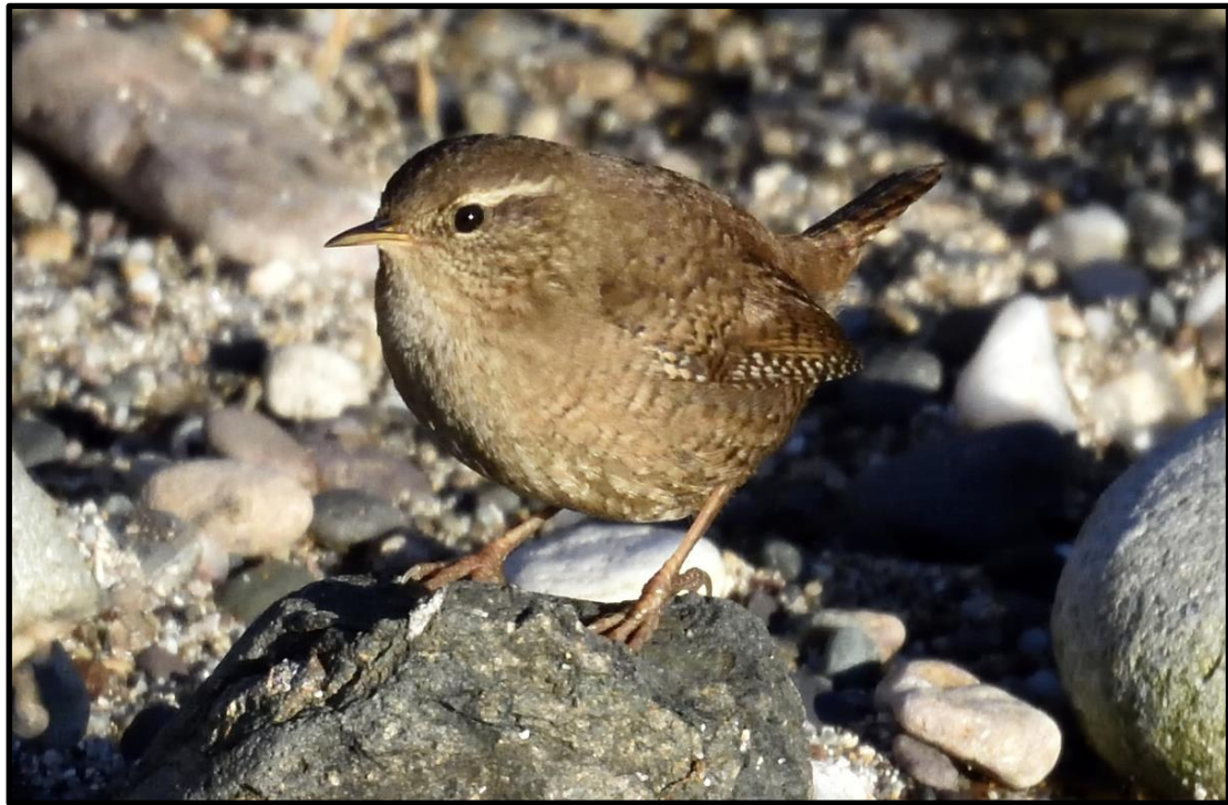
Wren – 2 nd / JG