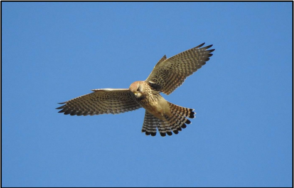
Common Kestrel – Southend 25 th January