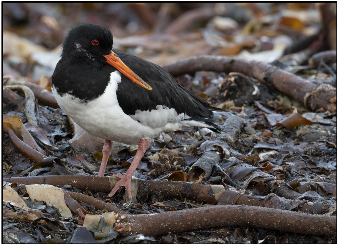
Oystercatcher – 12 th / JG