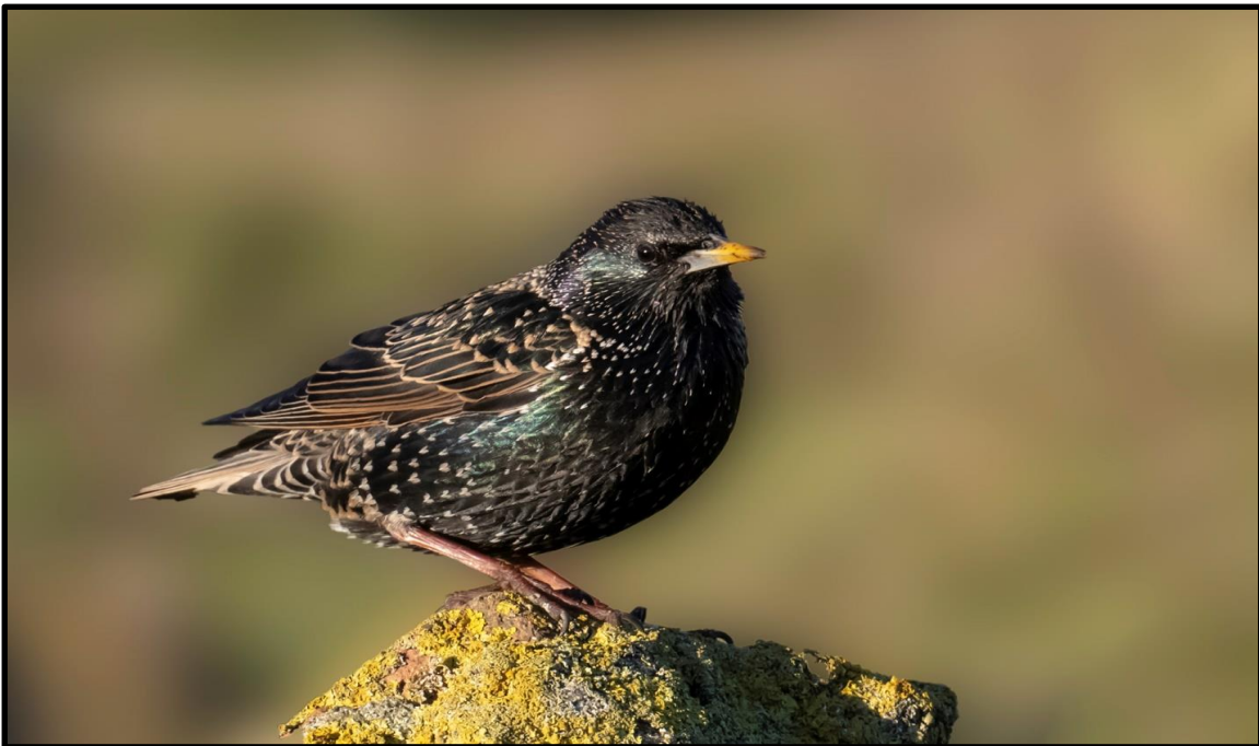
Starling – male 2 nd / DM