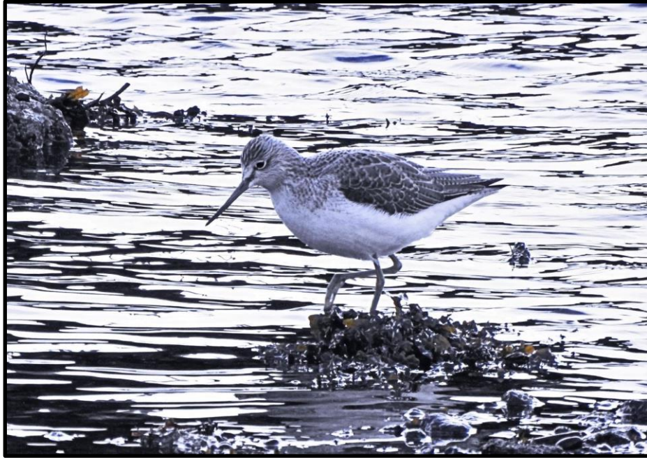
Greenshank – 23 rd January