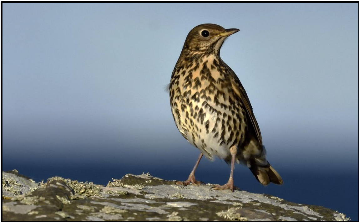
Song Thrush – 2 nd / JG