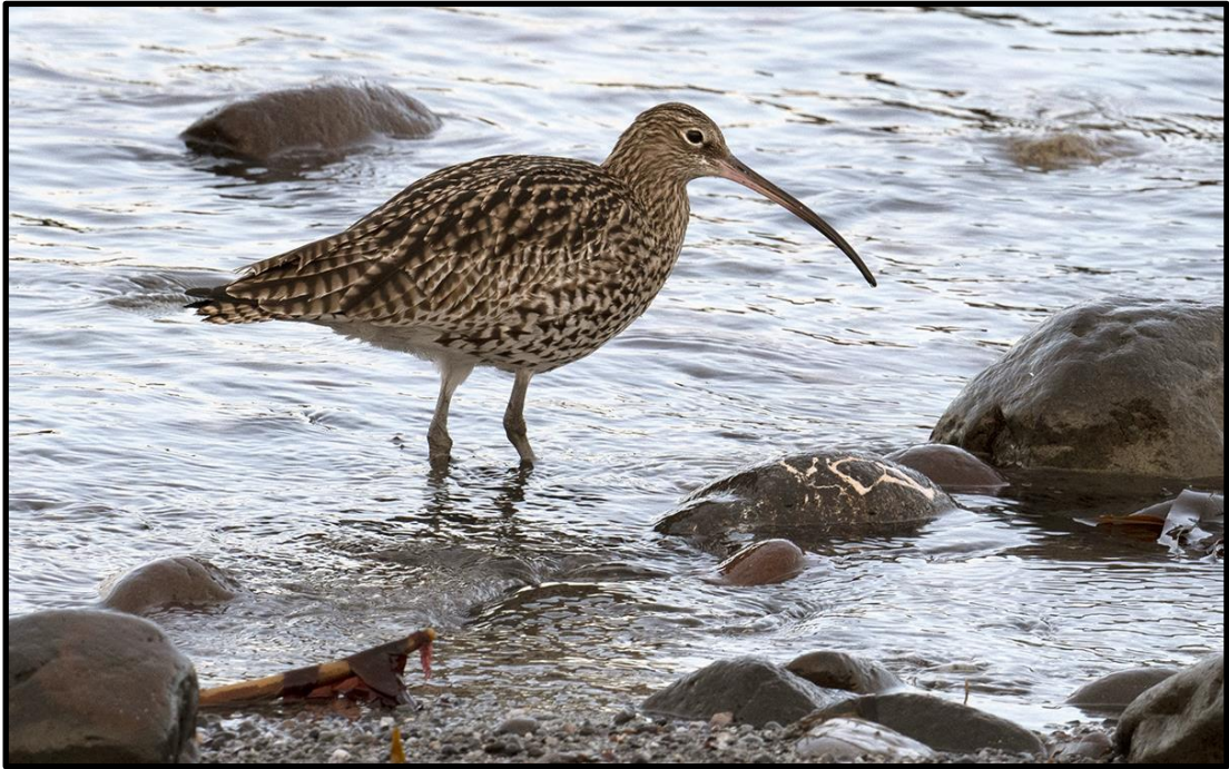
Curlew – 12 th / JG