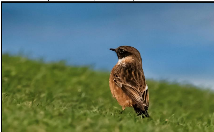
European Stonechat – 2 nd January