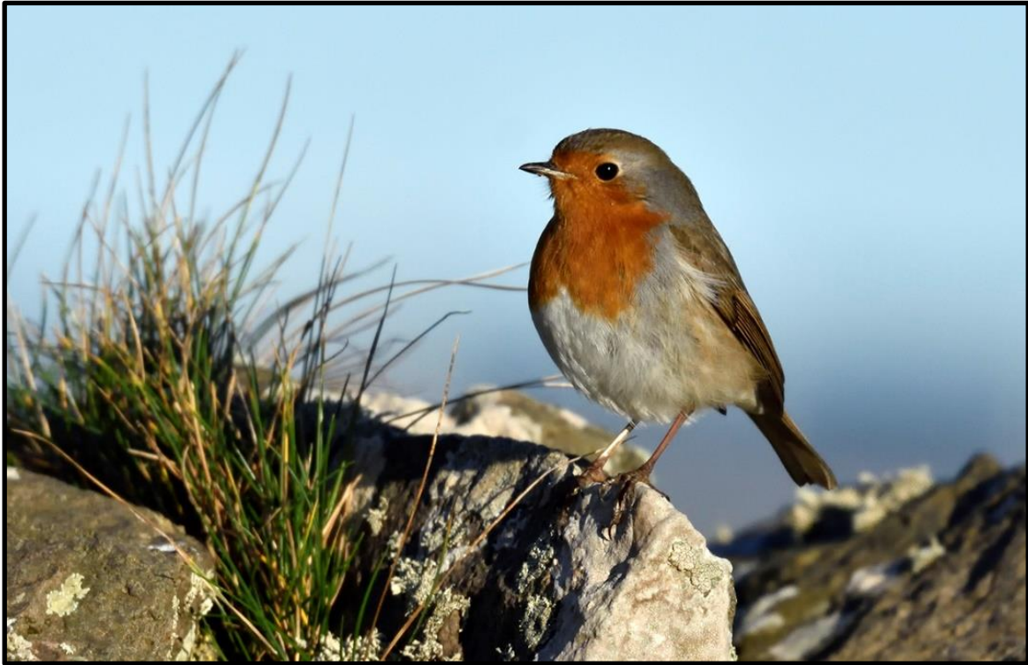
Robin – 2 nd / JG