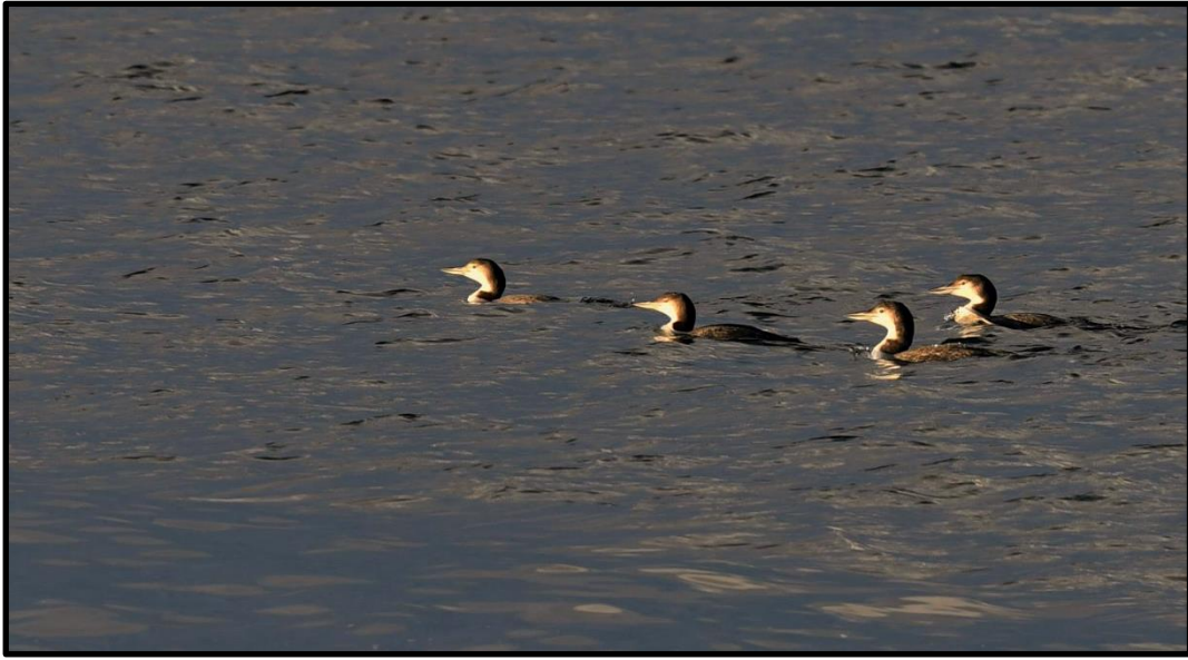
Great Northern Divers – 6 th January