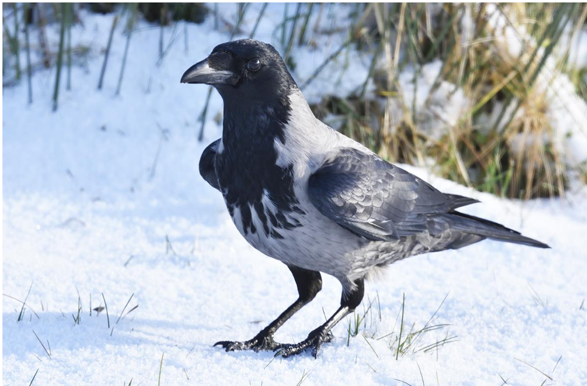
Hooded Crow – 24 th

A Selection of Photos from Machrihanish Airbase / MSBO during January By Jo Goudie (JG) / David Millward (DM)