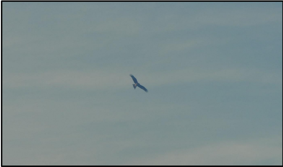
Red Kite – 1 st January / Errol Crutchfield