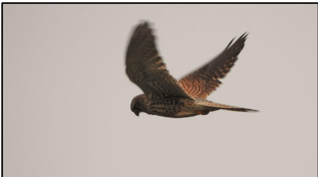
Kestrel – 17 th January / Errol Crutchfield

Machrihanish Airbase: a male on 31 st (Warden / Jo Goudie).