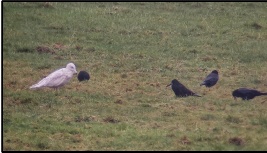
Glaucous Gull – 20 th January / Tom Lowe

Campbeltown: a 2 nd winter on floods at Kilmichael on 20 th (per Jim Dickson).