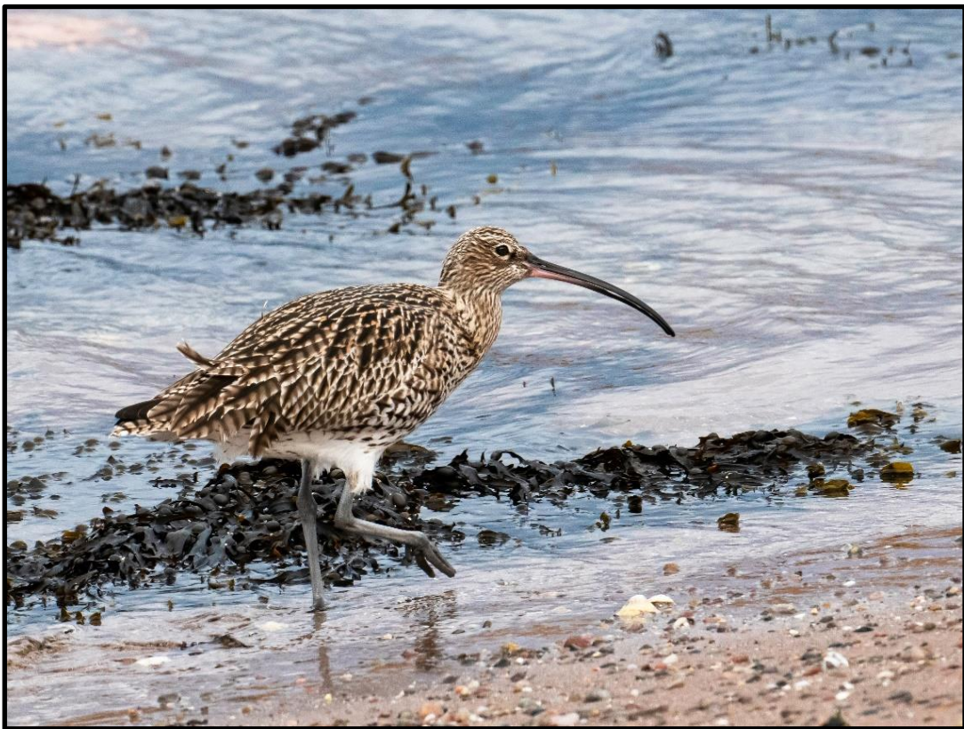
Eurasian Curlew – Campbeltown Loch 21 st March

Taken into care after storm event / readily accepted food & slightly salted water but succumbed a few days later.