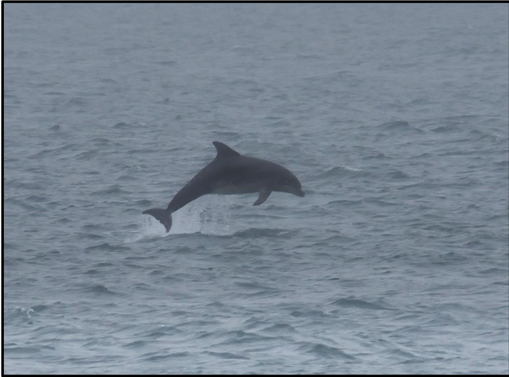
Bottle-nosed Dolphin – off MSBO 20 th March