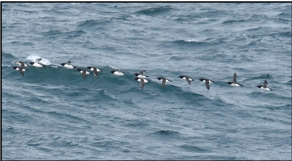
A 'train' of Razorbills >S off MSBO 20 th March

Three mixed flocks totalling 250 >S / 1.5hrs on 20 th (JG / DM).