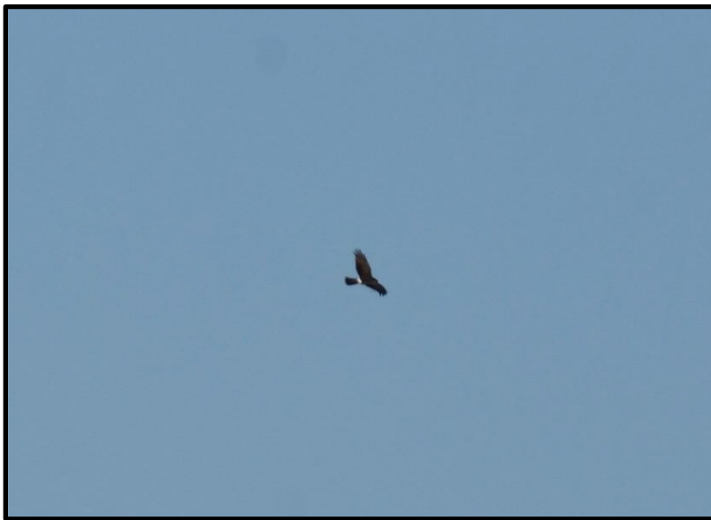
Hen Harrier – Ringtail high over Airbase 1 st March

North Kintyre: a ringtail was watched ranging low over juncus from the Kennacraig / Claonaig road on 12 th (BM et al. ).