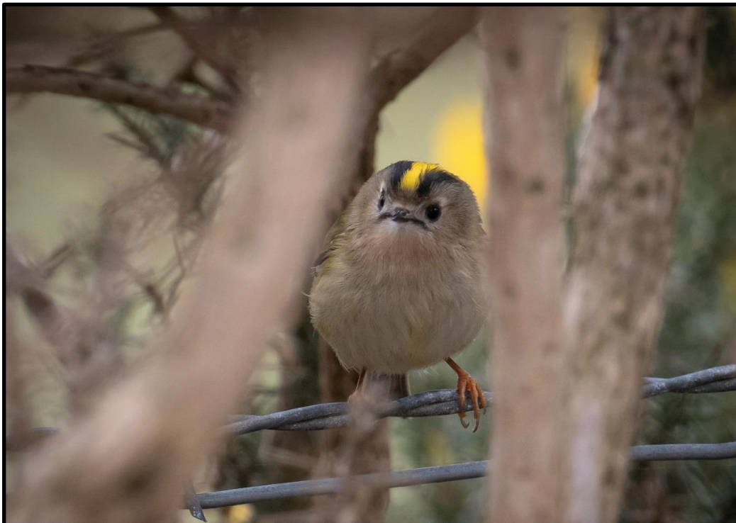
Goldcrest – 7 th March