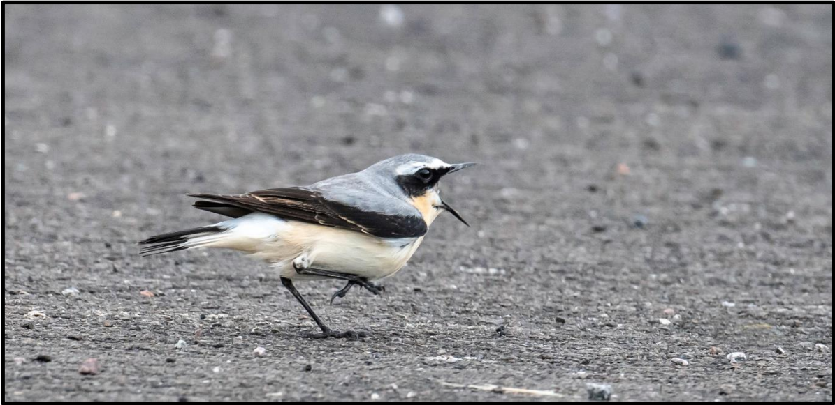
Northern Wheatear – 29 th March