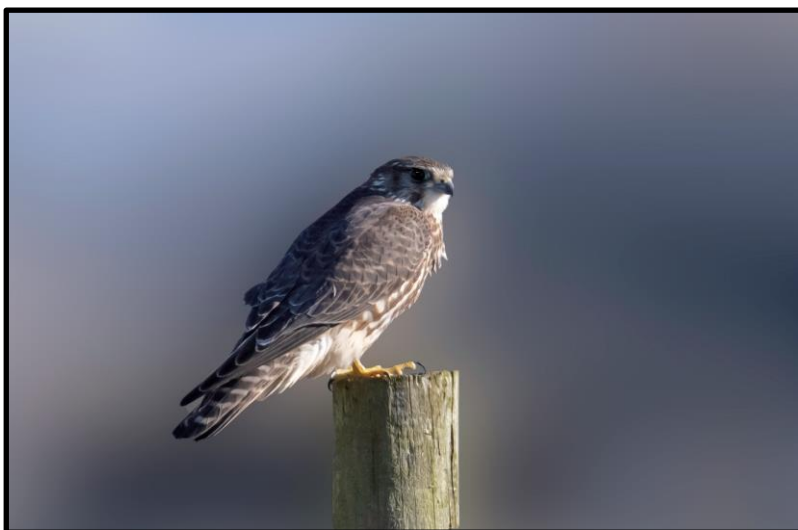
Merlin – Airbase 1 st March