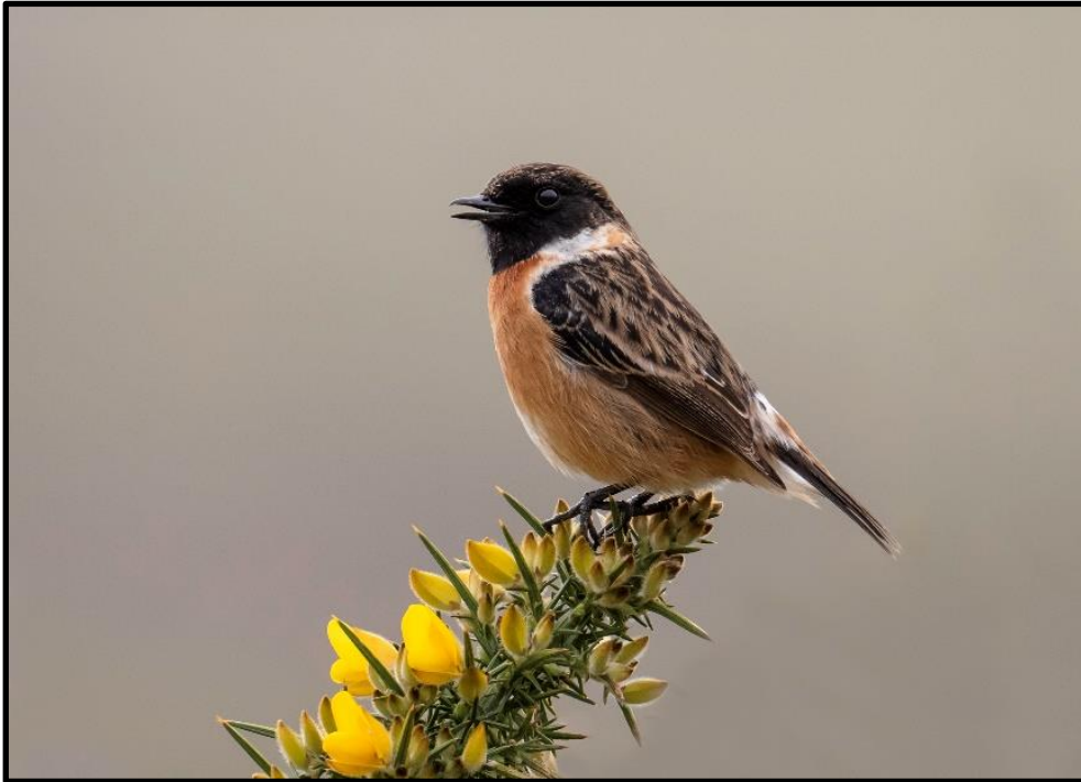
Stonechat – 21 st March