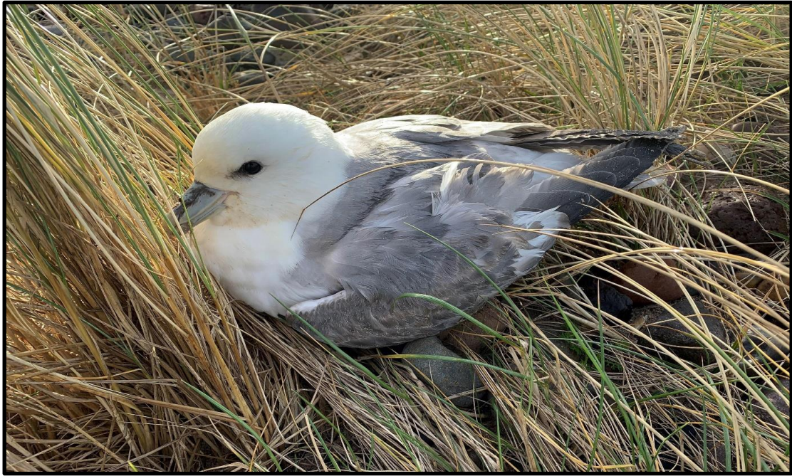
Northern Fulmar – Machrihanish 15 th March

Taken into care after storm event / readily accepted food & slightly salted water but succumbed a few days later.