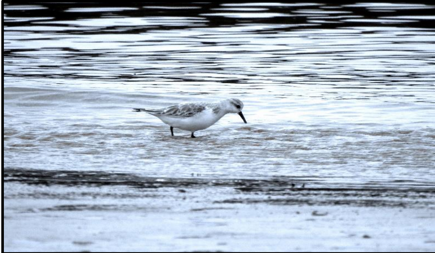
Sanderling – 7 th March

Machrihanish: 5 in the bay on 7 th and 30 >S off MSBO on 11 th (JG). Southend: 3 on 7 th (EC).