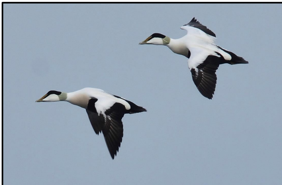
Common Eider – MSBO 7 th March