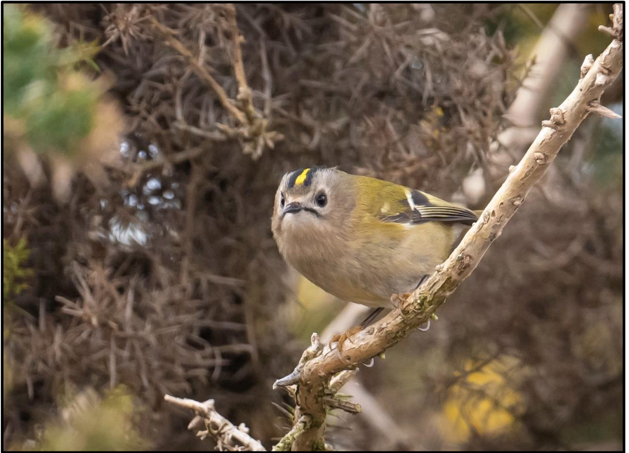
Goldcrest – 7 th March