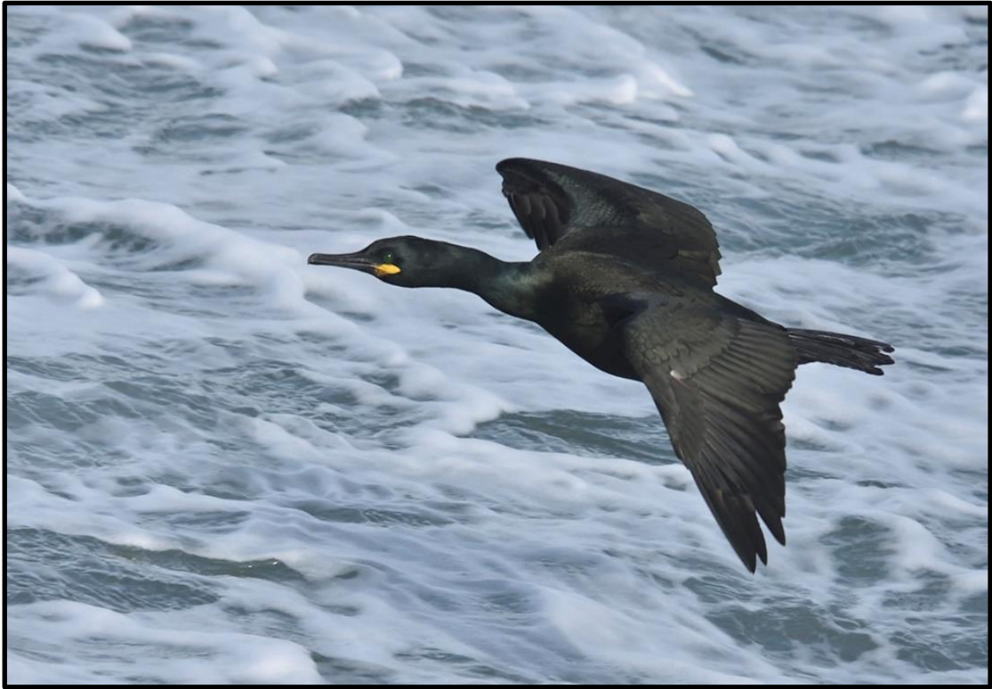
European Shag – MSBO 7 th March