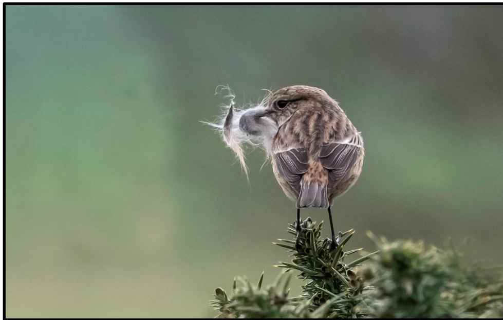
Stonechat – Nest-builder at Airbase 21 st March