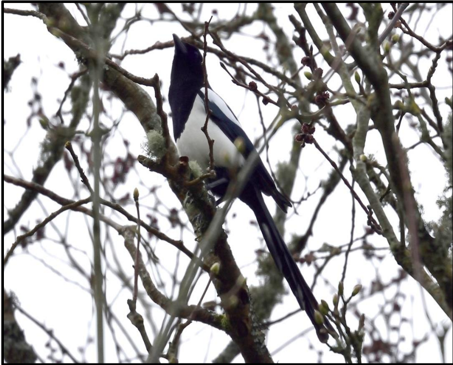
Magpie – Machrihanish 23 rd March