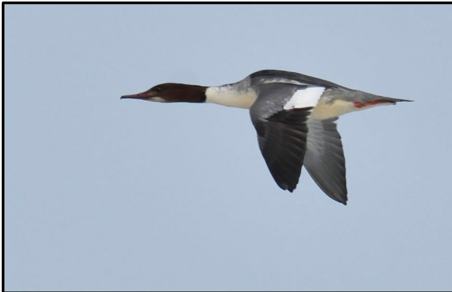
Goosander – >S 11 th March

One was photographed >S during a westerly gale event on 11 th (DM / JG / VC). A scarce passage visitor at MSBO / rare elsewhere in Kintyre.