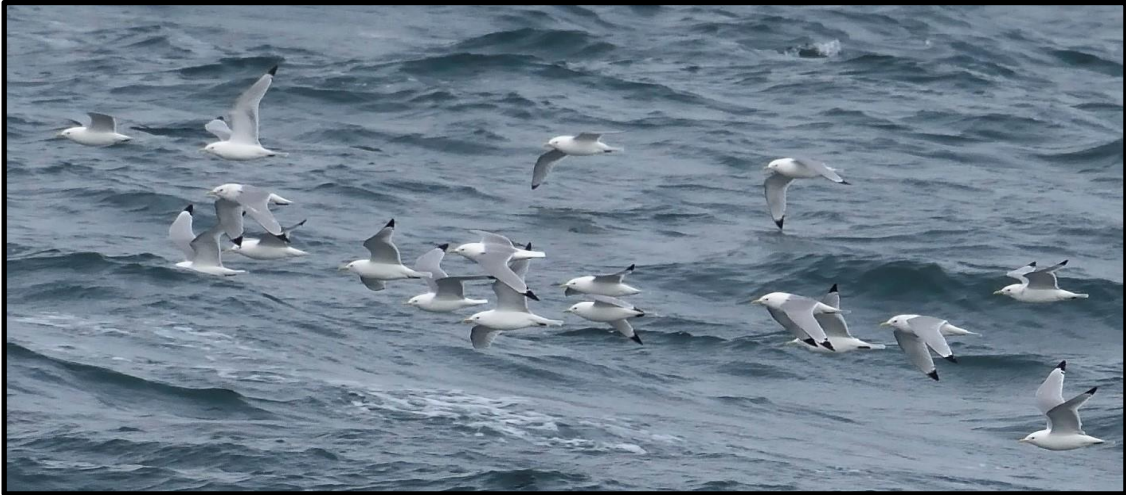
Black-legged Kittiwakes – 20 th March