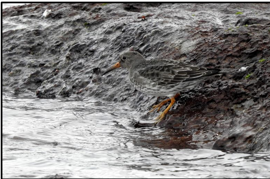
Purple Sandpiper – Southend 7 th March