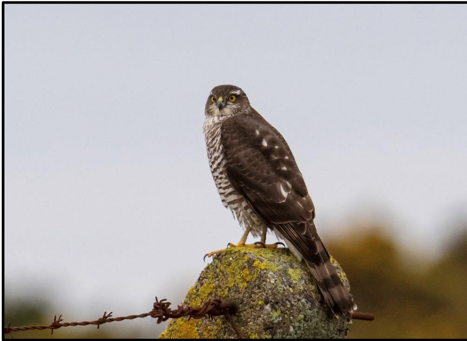
Eurasian Sparrowhawk – Airbase 7 th March