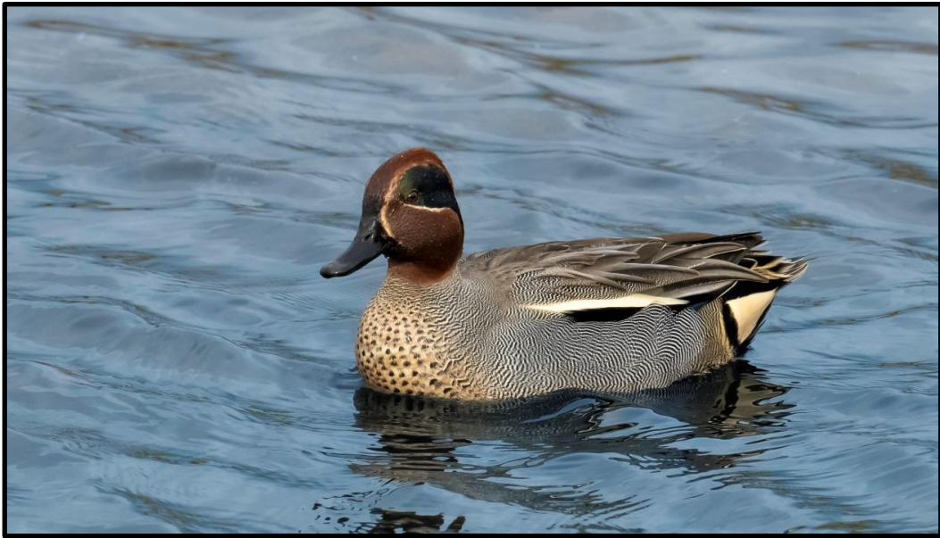
Eurasian Teal – Campbeltown Loch 21 st March