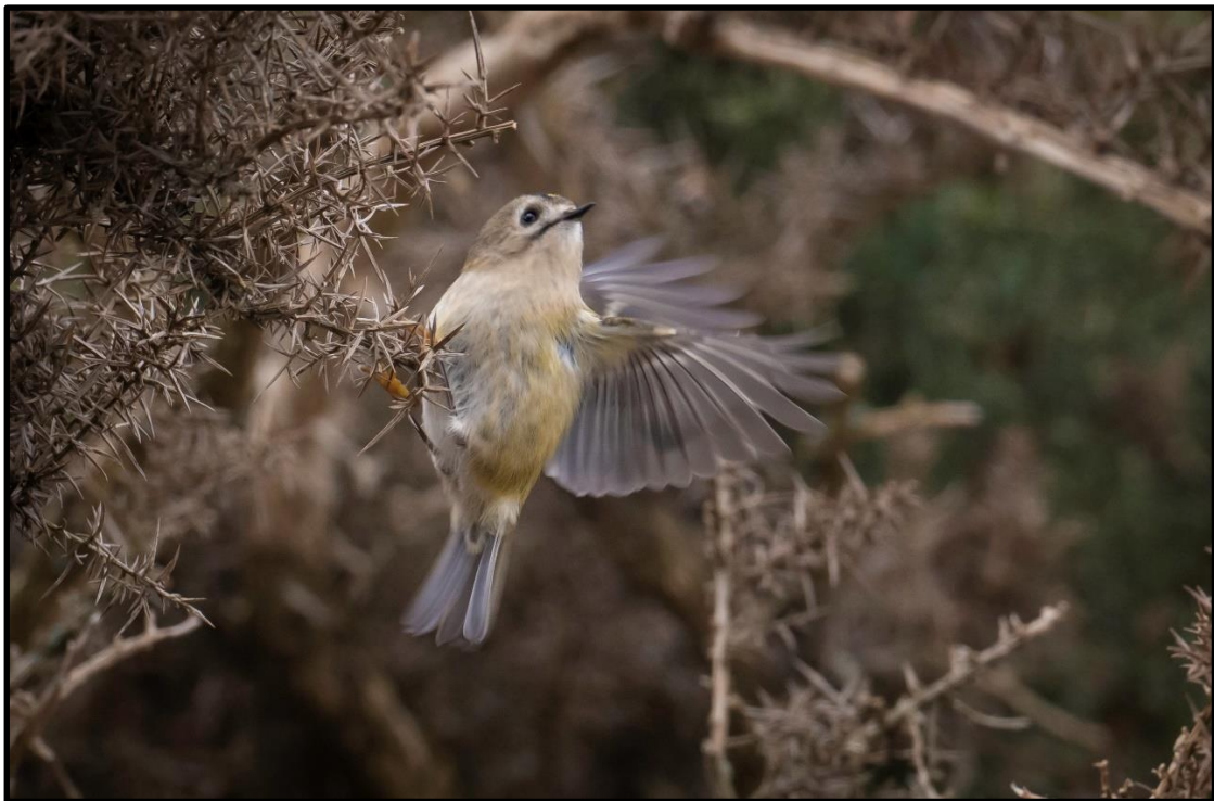
Goldcrest – Airbase 7 th March