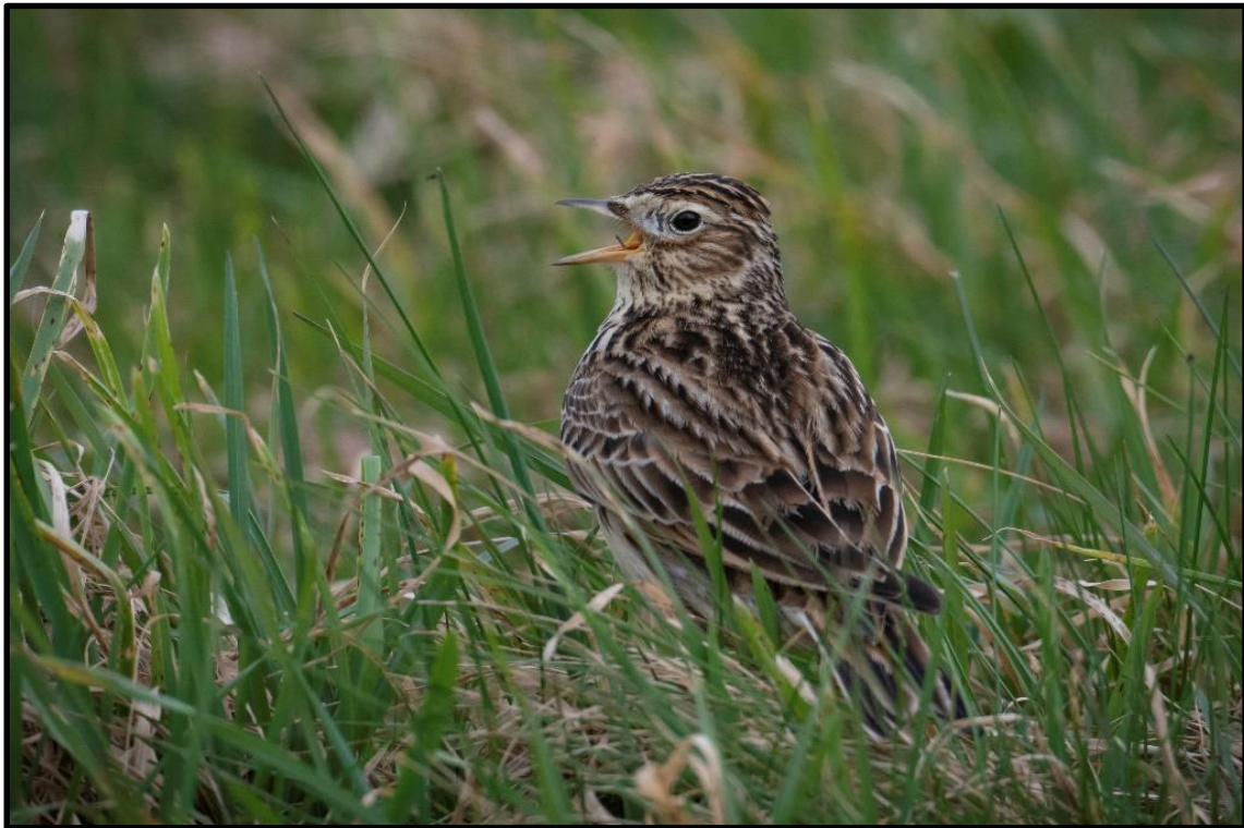
Skylark – 7 th March