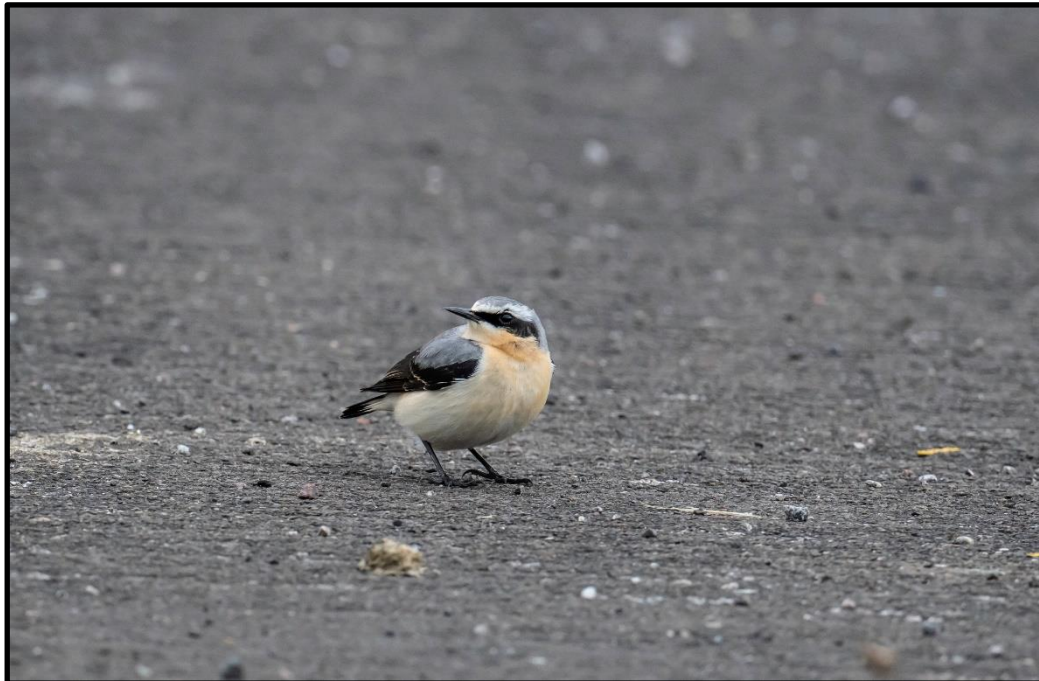
Northern Wheatear – Airbase 29 th March