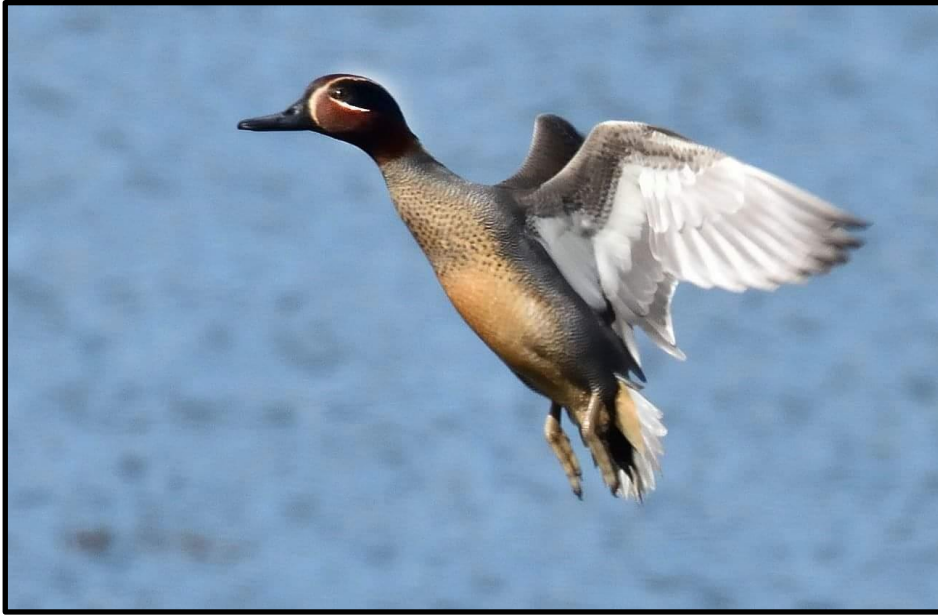
Teal - 24 th March

Campbeltown Loch: 4 at the Stinky Hole on 24 th (JG).