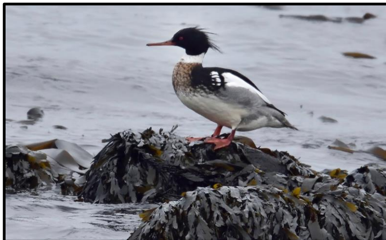
Red-breasted Merganser – MSBO 20 th March