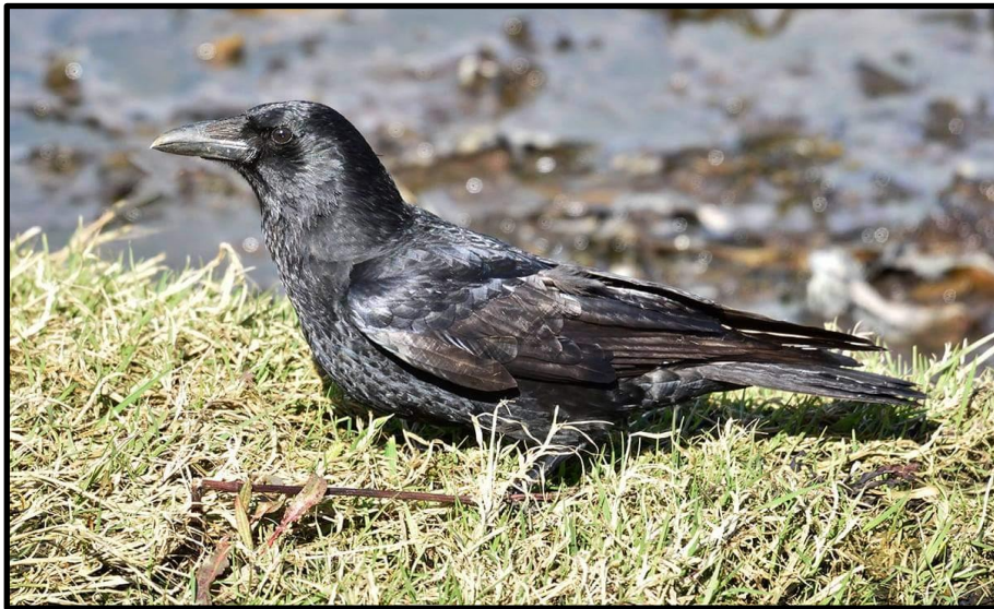
Carrion Crow – 24 th March / Photo JG

Campbeltown: 4 at the Stinky Hole on 24 th – the hotspot for this species locally.