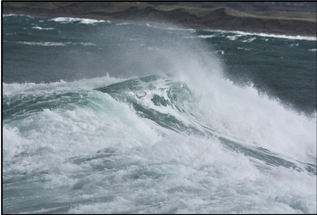
Storm event - MSBO 7 th March