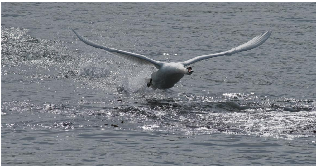
Mute Swan taking flight