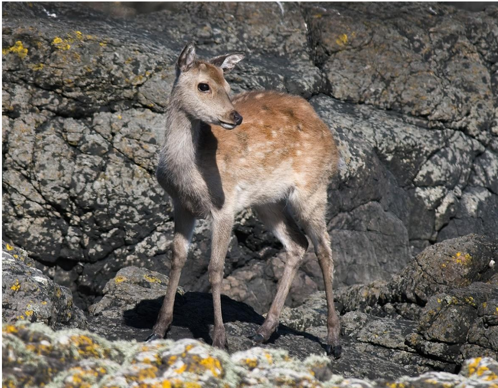
Sika Deer - appeared on the point right in front of the observatory. Wasn't expecting to see this. 29/05/22