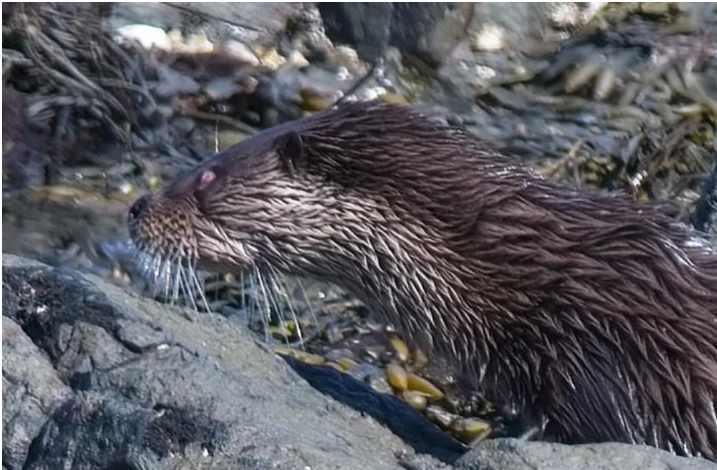
Otter - showing a facial injury.

Shelduck - still a regular 8 in pairs seen in the waters from Machrihanish Bay to the observatory.