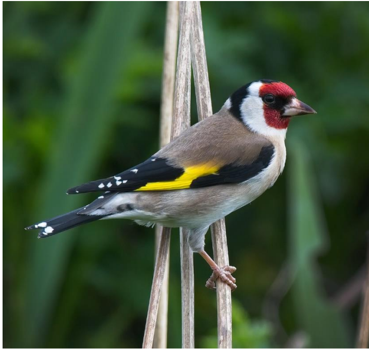
Goldfinch - seen regularly in the area and feeding in front of the observatory.