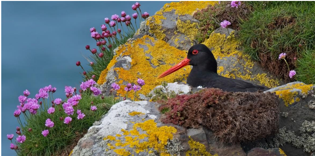
Oystercatcher on the nest at the beginning of the month.