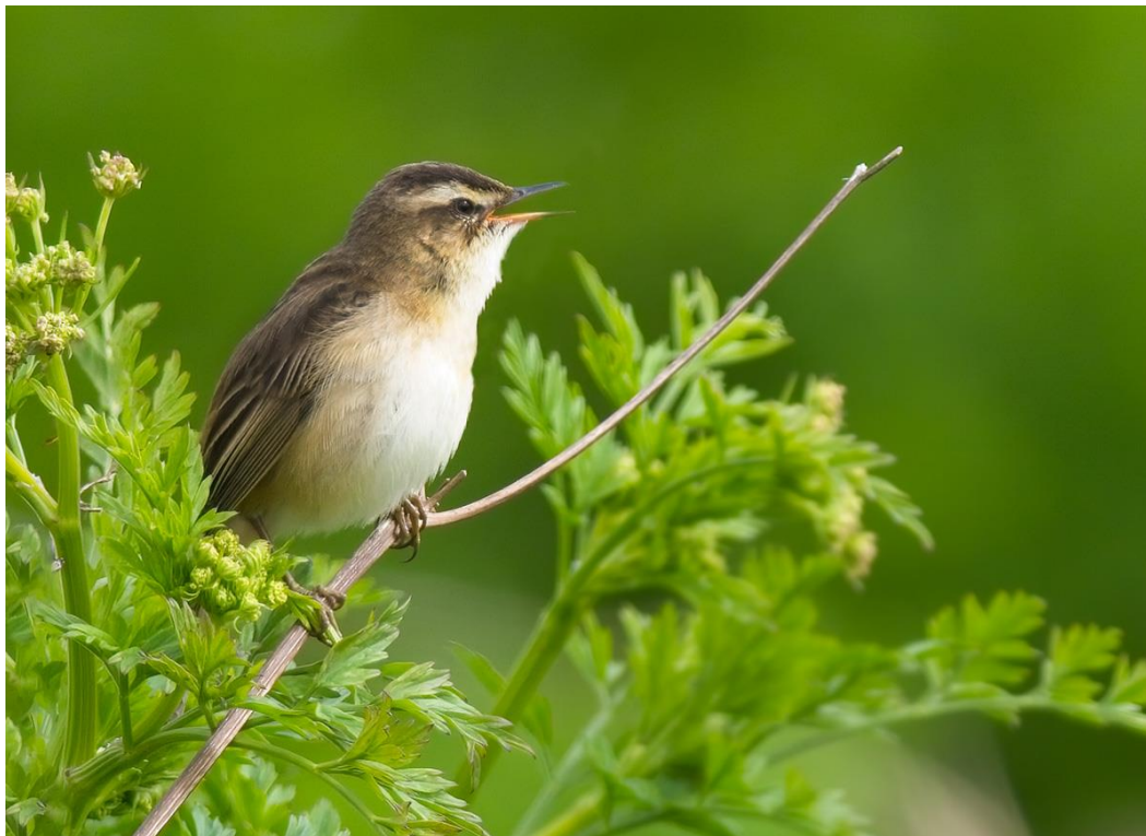
Sedge warbler - Only 2 sighted forming a territory near the observatory this year. Very disappointing.