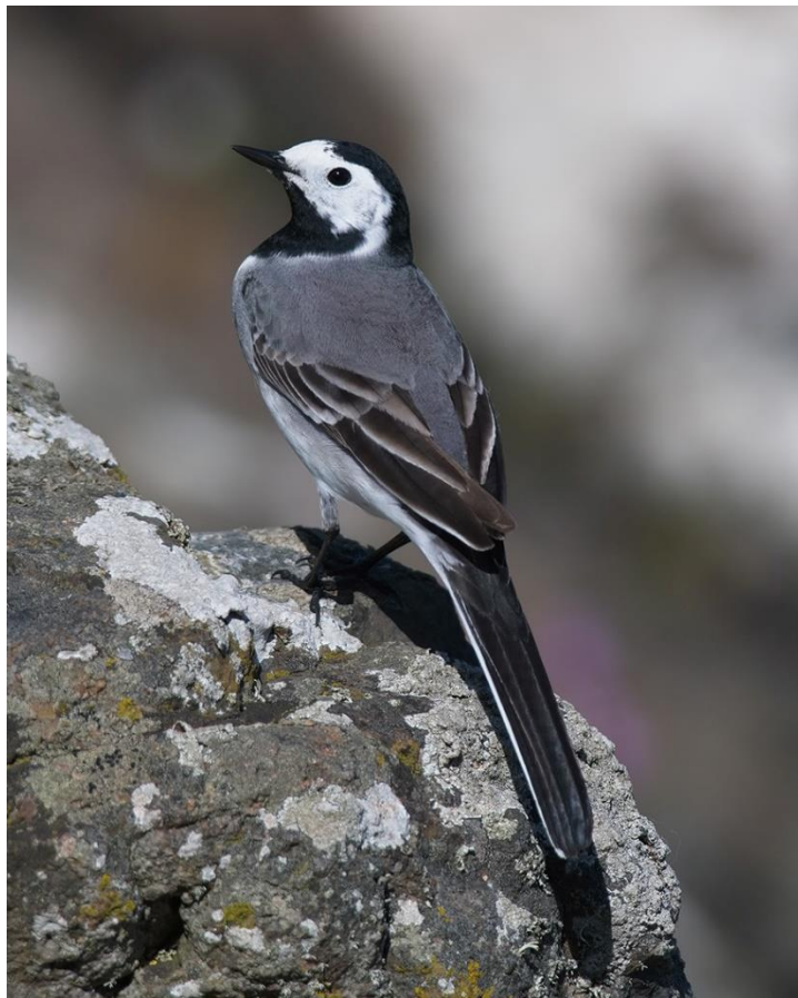
White Wagtail - from 1 on the 3 rd , numbers increased by a couple every visit to a peak of 15 seen on the 15/05/22.