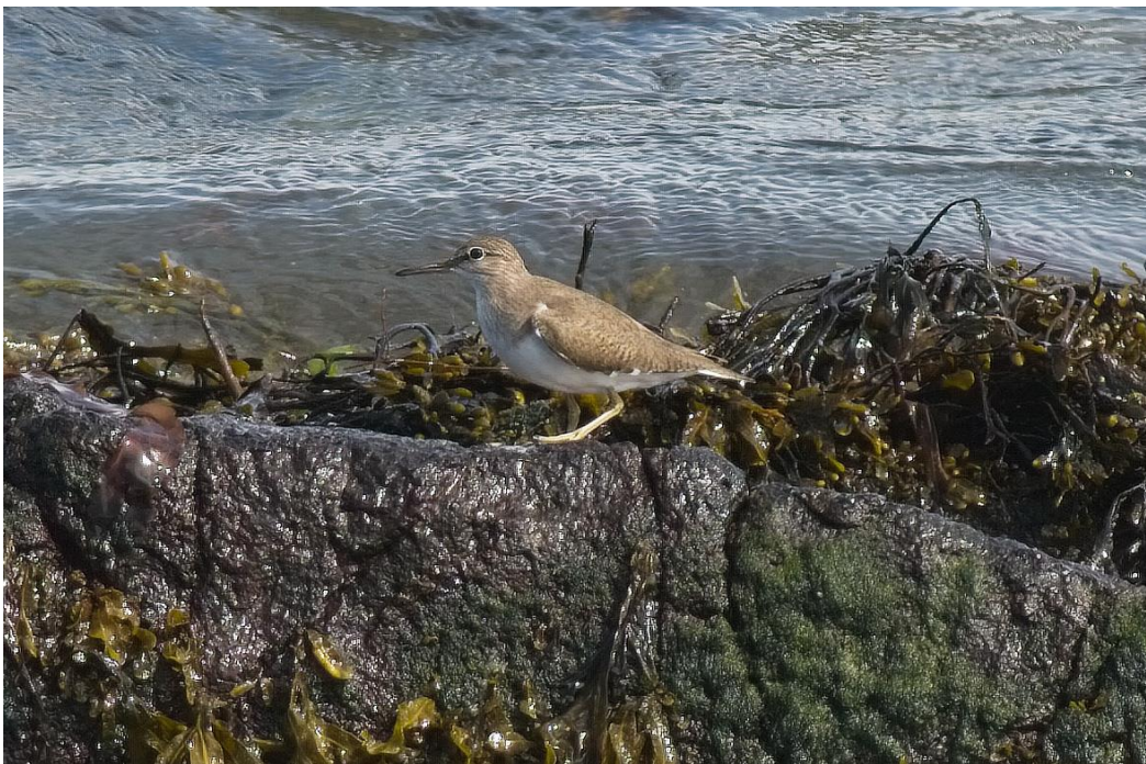
Sandpiper - a lone 1 seen on the 1 st and 2 nd of the month but had been joined by a second one by the 11/05/22.