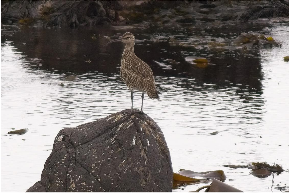
Whimbrel - 3 seen on both the 1 st and 2 nd of the month, 15 seen on 11/05/22 but only a further 1 seen on 12/05/22.