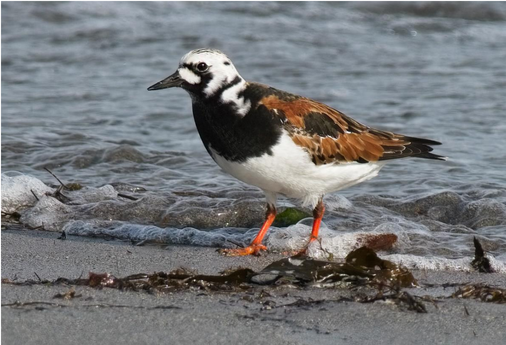
Turnstone - 4 seen feeding in Machrihanish Bay on 11/05/22, 2 outside the observatory on 12/05/22 and only 1 seen on 14/05/22.