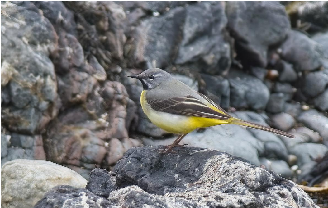
Grey Wagtail - Seen feeding in front of the observatory on 03/05/22.