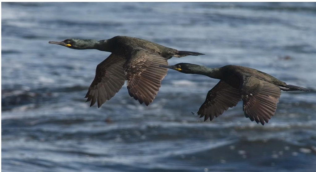
Shag - regularly sighted flying past the observatory as they feed.