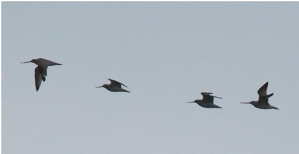
Bar Tailed Godwits - 4 seen flying South over the observatory on 03/05/22.

Mixed flock of small waders seen flying past the observatory 15/05/22 and settling in Machrihanish Bay. Comprising of 15 Ringed Plover , 8 Sanderling , 2 Dunlin .