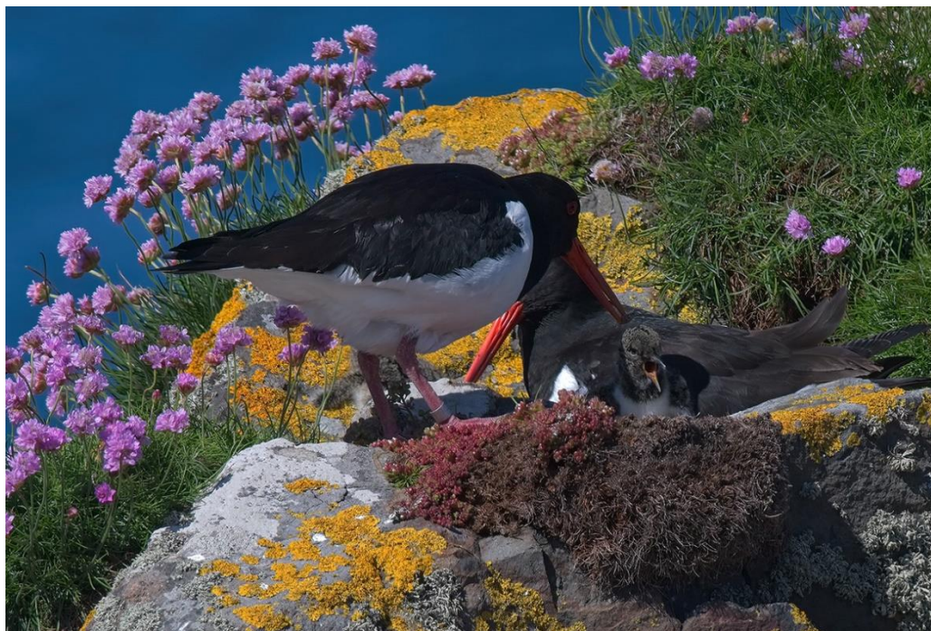
Oystercatcher with 2 chicks on the 29/05/22. It is so good to see them successfully hatching 2 chicks.