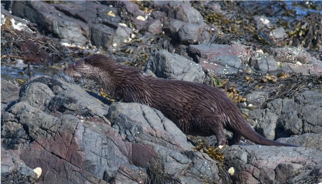
Otter - Seen next to the observatory 29/05/22