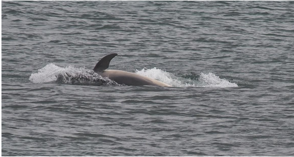
Dolphin – group of around 4 seen feeding around Machrihanish Bay on 22/05/22.