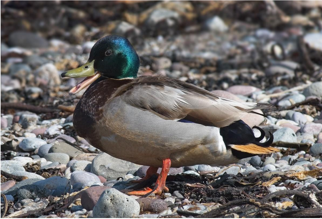
Mallard - Regular group of around 10 seen around the observatory.