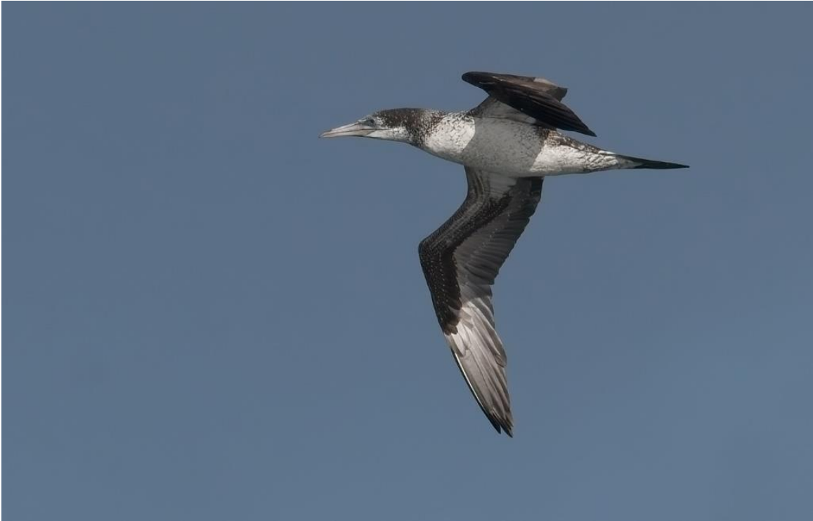
First Year Gannet